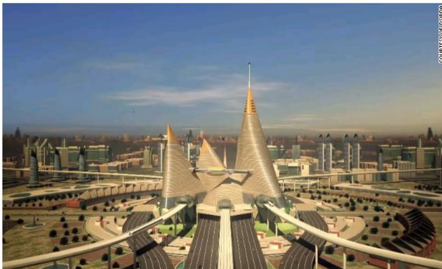
A rendering of the planned 'smart city' Dholera, in southern Gujarat, India. Prime Minister Narendra Modi has pledged to build 100 smart cities across the country.

July 18, 2014 -- Updated 0621 GMT (1421 HKT)